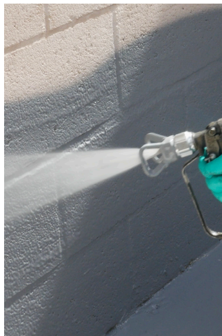
Application by airless spray