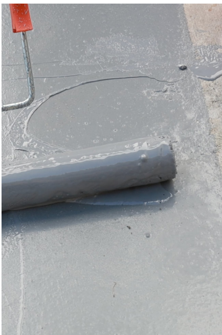
Application by roller

The coating can be applied by brush, roller, squeegee, and airless spray equipment. It is available in two distinctive colors, gray and khaki, to aid application of the two-coat system.