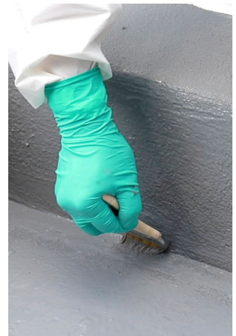
Application by brush

Please consult the Product Specification Sheet (PSS) and Instructions for Use (IFU) of Belzona 5815 for technical details.