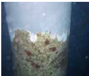
Provide long-term corrosion protection in the splash zone

Belzona 5831LT is recommended for applications on to lower temperature substrates e.g. colder offshore waters