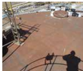
Extend the lifespan of assets versus environmental attack

Belzona 5831 is recommended for applications on to higher temperature substrates e.g. tropical conditions