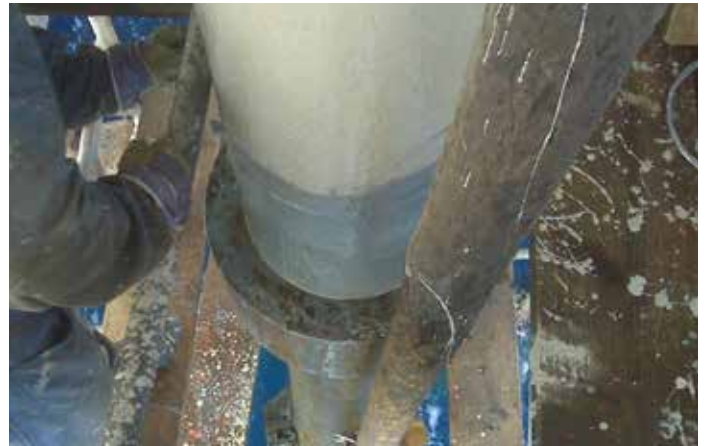
Belzona 5831LT is moisture tolerant and ideal for use offshore

It can be used as a complete repair solution in combination with Belzona 1161, a surface-tolerant, paste-grade repair composite.