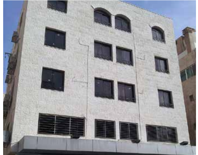
Invisible protection applied to hotel façade

Belzona 5122 helps to reduce dirt retention as well as deter the growth of mildew, moss and lichen.